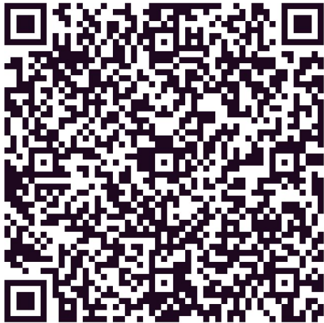
Direct Uniswap Buy Link

This QR code opens Uniswap with VLT already pre-loaded.